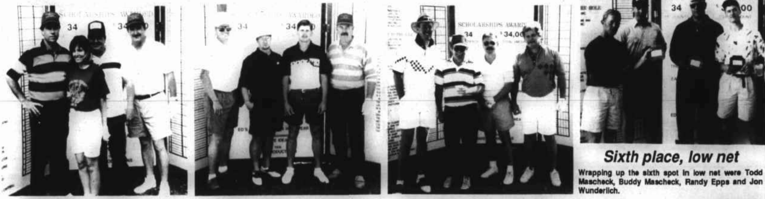
Second place, low net