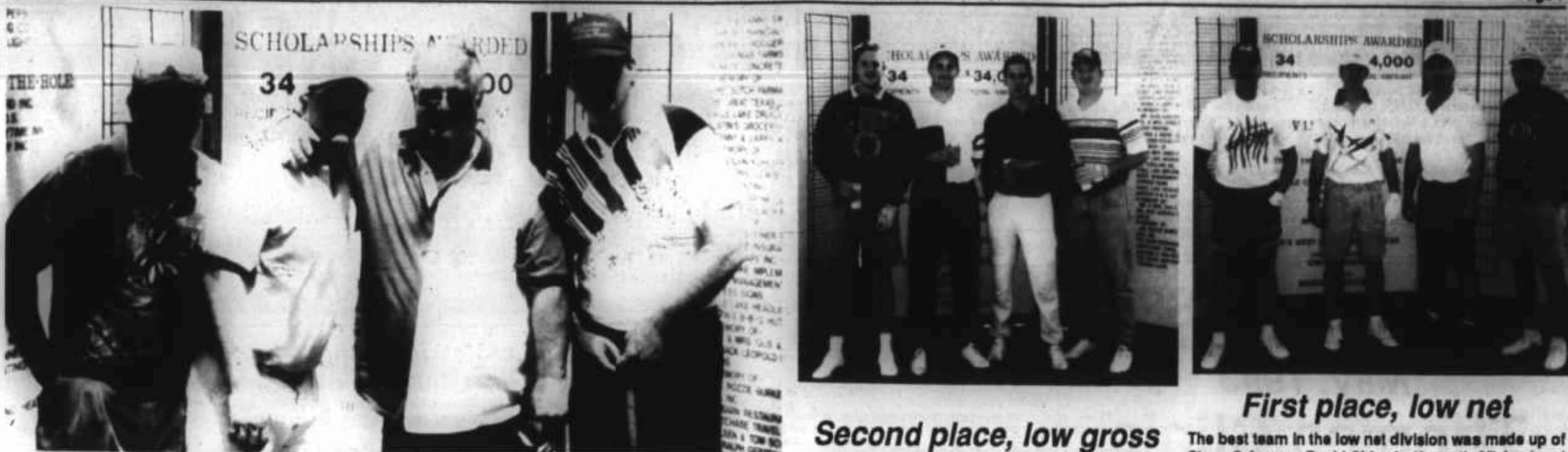
First place gross, fourth place net